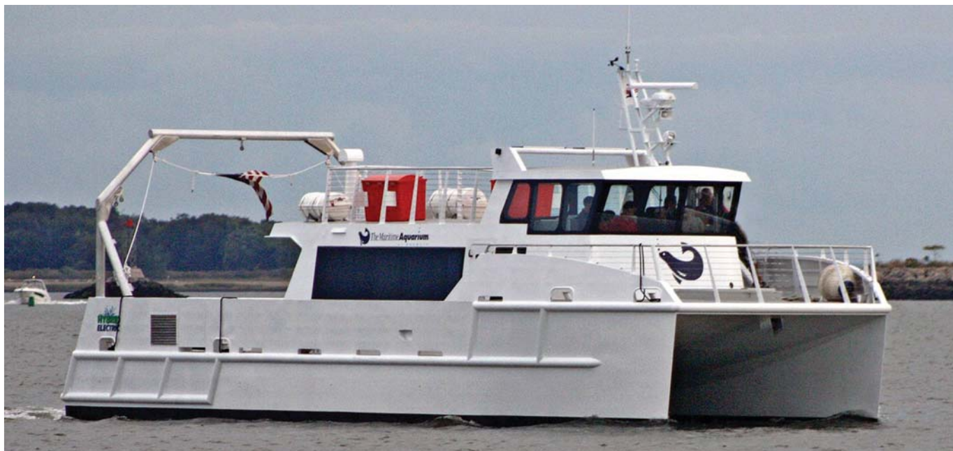
The Maritime Aquarium at Norwalk research vessel ‘Spirit of the Sound’ is equipped with BAE Systems HybriGen technology.

system to the 19 m (62 ft.) research vessel Spirit Of The Sound. She runs virtually silently on battery electric power for two hour study cruises on Long Island Sound.’